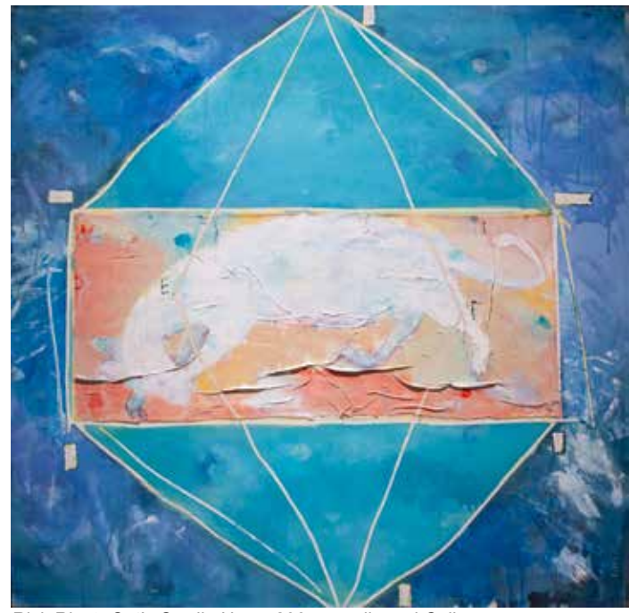
Rick Rivet, Cat's Cradle No. 5 , 2005, acrylic and Collage on canvas, 43.5 x 43.5 in.

In this series of paintings Rick Rivet explores figures created by string games, evoked by white lines and letters, which sometimes indicate cardinal directions or resemble instructions. Cat's Cradle involves the creation of various string patterns, either individually, or by passing the looped string back and forth between players. Versions of the game have been found throughout the world, including in Indigenous cultures. The Inuit created some of the most complex and fascinating string figures. They have long played string games for entertainment,