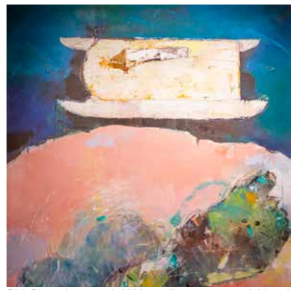
Rick Rivet, Journey 56, 2003, acrylic on canvas, 42.91 x 43.31 in.

A common motif in his journey-related paintings, such as the Beothuk Mound series, is the vessel, often in the shape of a canoe or sled. The boats and canoes are rendered from above or as a hull seen from the side. In Rivet's paintings they are metaphors for spiritual or personal/physical travel.<sup>5</sup> The boat and canoe symbols can also serve as a window or portal to another world. In his Beothuk Mound paintings , for example, the canoe signifies the Beothuk people's spiritual journey, carrying their soul to the afterlife. Many of these paintings are divided into sections, indicating the spirit's, or shaman's, ability to travel along a vertical axis from this world into either the upper or lower worlds. Journey 56 depicts a sled seemingly floating over water. The land below shows a large, green footprint, reminding us to reduce our impact on the environment before we leave this planet.