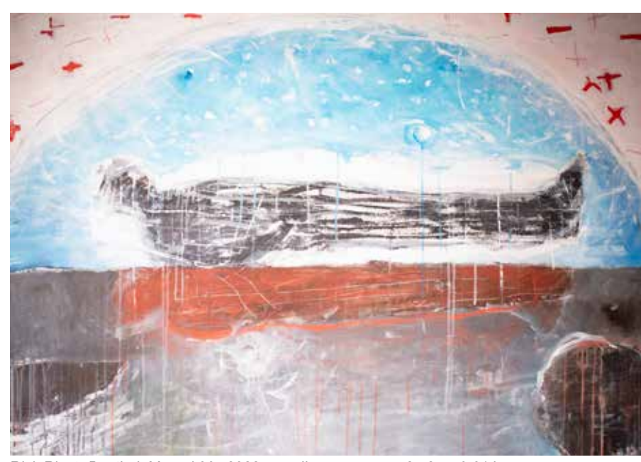
Rick Rivet, Beothuk Mound 23, 2022, acrylic on canvas, 42.52 x 49.61 in.

similar to a "ship for the dead" in other cultures. Rivet depicts a bird reminiscent of a burial object planted deep in the earth below the canoe. Birds are also a symbolic representation of travel—migrating from one world to the next, like the spirits of the Beothuk.<sup>7</sup> Rivet has explained it this way: "I was always fascinated by archeology, by funerary symbols and the different styles of tombs. By the manner in which, one way or another, we bury history."<sup>8</sup>