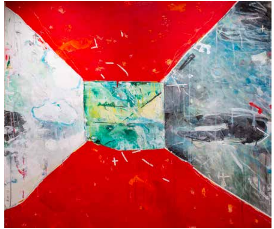
Rick Rivet, Box of Rain 2, 2019, acrylic on canvas, 42.13 x 48.43 in.

For Rivet, art is a meditative process whereby the artist, like a shaman, mediates between the spiritual and human worlds. His early works examine the beliefs, rituals, and traditions of Indigenous cultures through figures, masks, drums, string games, pictographs, and symbols of shamanism, while challenging the history and mentality of colonialism. Later works analyze the migration of the human spirit in a series of paintings featuring burial mounds, canoes, and mythical scenes. He uses these motifs as metaphors to make the invisible metaphysical realities visible, and to illustrate the mystical relationship between human and spiritual worlds. Rivet describes his painting process as "states of being and becoming, a gradual revelation of the conscious/unconscious . . . the artist being the catalyst to the mystery of creative action." 10