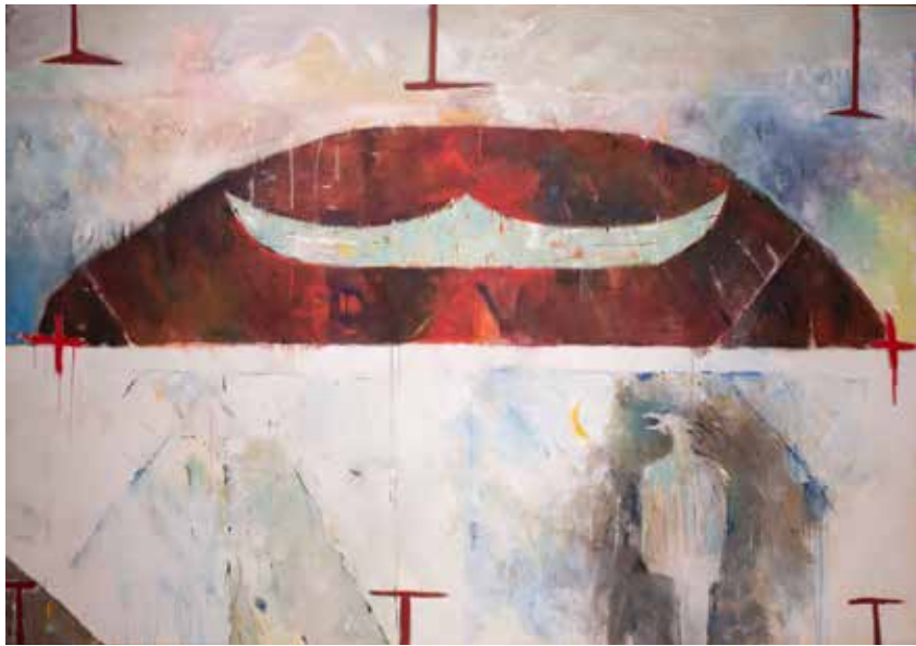
Rick Rivet, Beothuk Mound #6, 1996, acrylic on canvas, 65 \frac{1}{2} x 91 \frac{1}{2} in. Peabody Essex Museum

In Rivet's works, such as Beothuk Mound #6 , the canoe is enclosed in a mound and serves as a funerary symbol, acknowledging the loss of the Beothuk culture. These abstract memorial paintings resemble cross-sections of burial mounds containing funerary offerings and alluding to the objectification of the Beothuk and their burial practices. The canoe not only signifies our memory of the "Beothuk as artifact," but also evokes their belief in their eternal soul's journey to the afterlife,