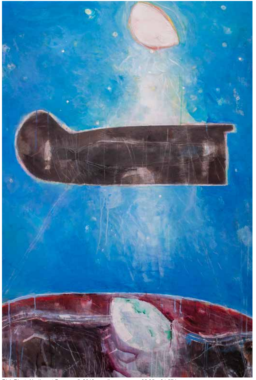
Rick Rivet, Northwest Passage 5, 2019, acrylic on canvas, 65.35 x 64.57 in.