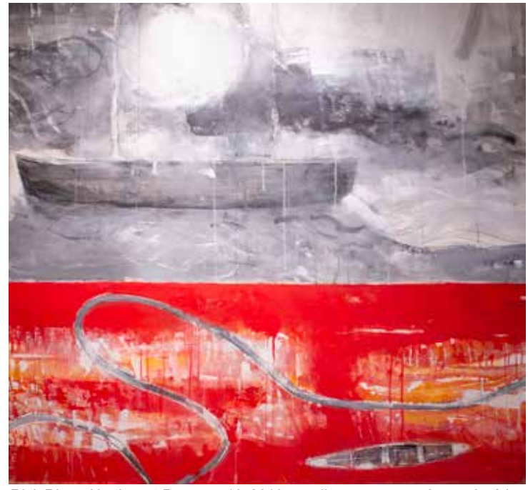
Rick Rivet, Northwest Passage 10, 2019, acrylic on canvas, 43.7 x 46.46 in.

Rick Rivet's Northwest Passage , Amundsen , and Franklin Expedition paintings explore the challenging sea route between the Atlantic and Pacific through the Arctic Ocean. Northwest Passage 10 memorializes the reckless expeditions of the colonialist explorers who sought a navigable passage, but disregarded the survival methods of the local Inuit, assuming their knowledge was inherently inferior. This arrogant attitude resulted in the unnecessary loss of numerous lives. Rivet's Northwest Passage 10 shows one of the two British ships of the 1845 Franklin expedition, which was ill-prepared and consequently lost the lives of 129 men. Rendered in a divided composition indicating different world views, the large British ship is shown in sepia-toned