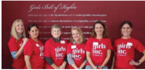
Career day at Girls Inc. of Santa Fe

WOMEN of THORNBURG ENGAGE • ELEVATE • EMPOWER