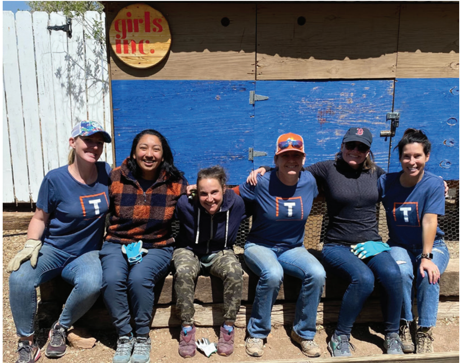
Women of Thornburg volunteer at the Girls Inc. of Santa Fe Campus Spring cleanup event

WOMEN of THORNBURG ENGAGE • ELEVATE • EMPOWER