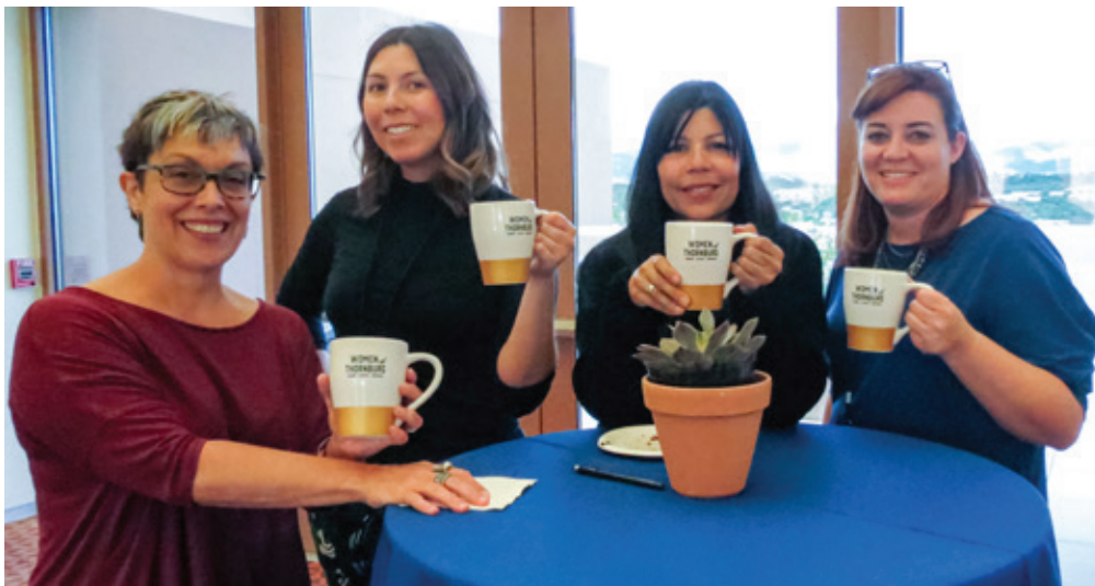
Women of Thornburg kickoff event

The Women of Thornburg is an employee resource group at Thornburg for those who identify as women or gender nonconforming. The group organizes networking events, educational opportunities, and ways to give back to the community. Like Girls Inc. of Santa Fe, Women of Thornburg believe in the important work to engage, elevate, and empower women in their careers and communities.